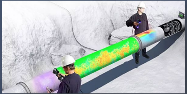
Non-Destructive Examination (NDE)