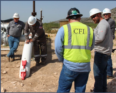
Pipeline Integrity Support